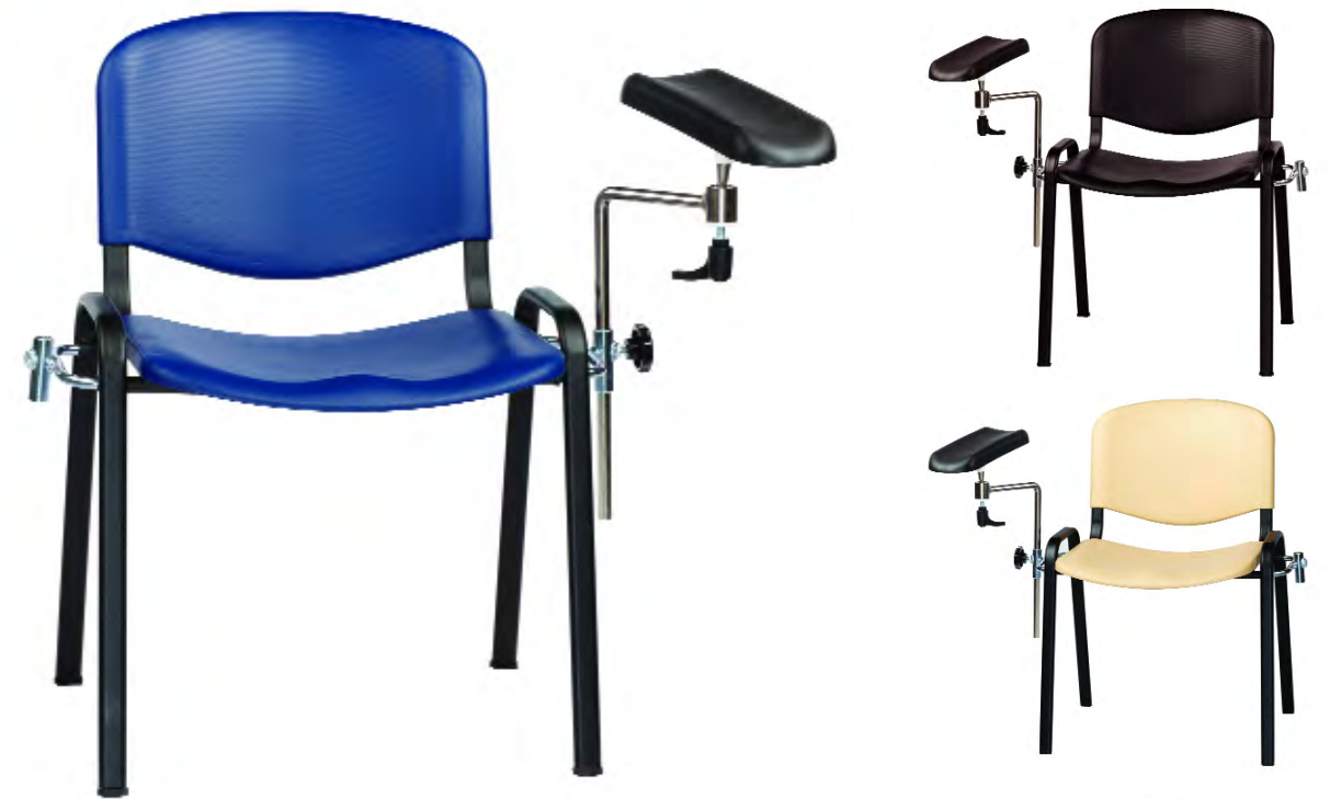
Code: Sun-PCHA Phlebotomy/treatment chair Moulded seat and back, one arm rest

Durable, stable and ergonomically designed, phlebotomy chairs are easy to use and adjust and can be used left, right or dual sided with an additional arm, whilst also being easy to clean.