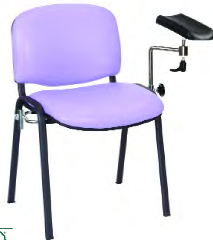
CODE: Sun-PCHA/VYL Phlebotomy/treatment chair Vinyl upholstery, one arm rest