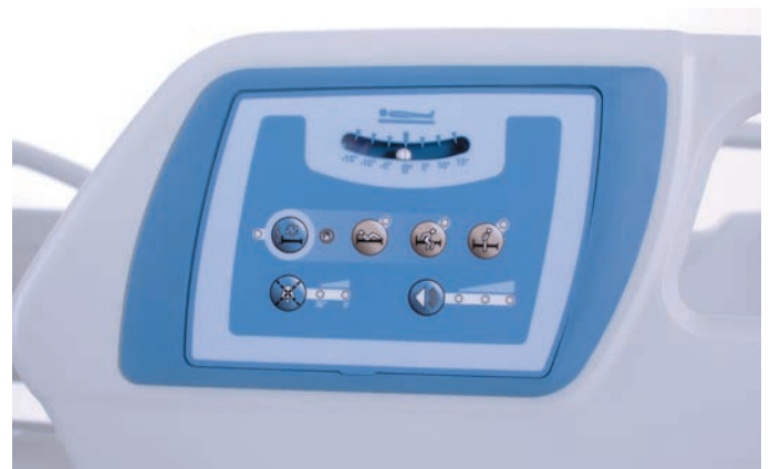
3-Mode Bed Exit Alarm