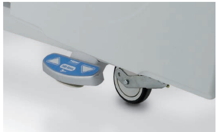
Optional bilateral high-low foot control with automatic lock-out and 5th steering castor