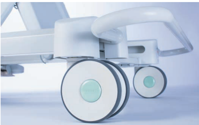
Optional 125 mm double band castors**